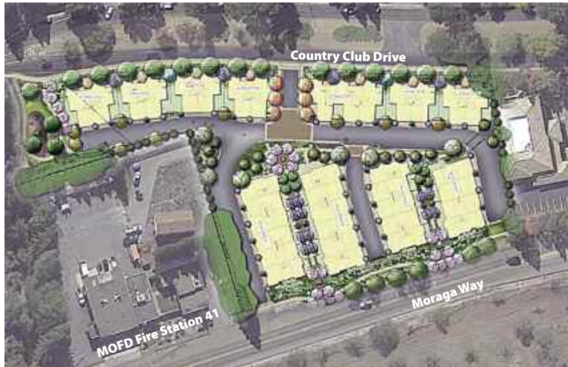
Rendering of the Moraga Center development.